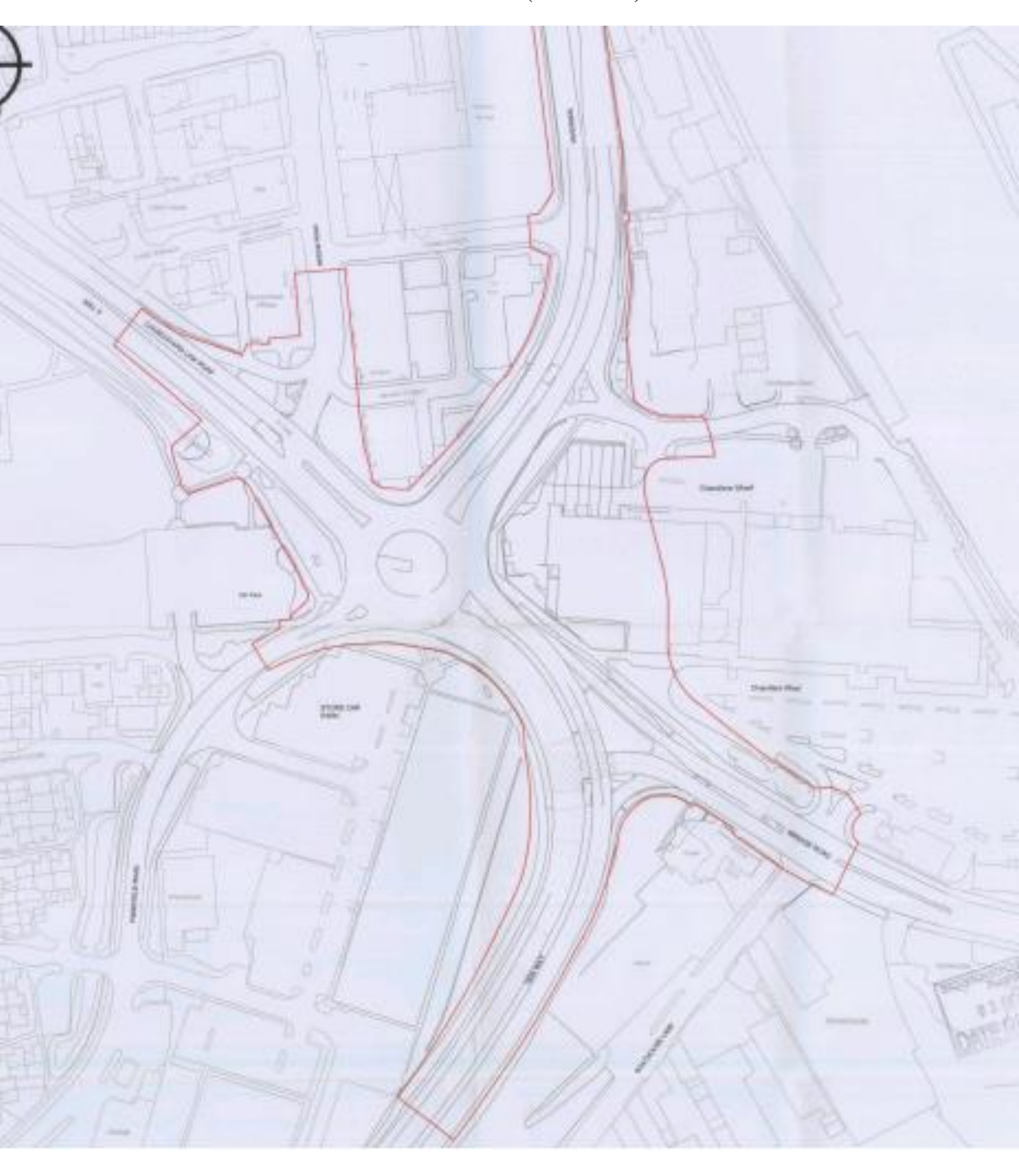
APPENDIX 1 – SITE LOCATION PLAN (10/0228/LA)